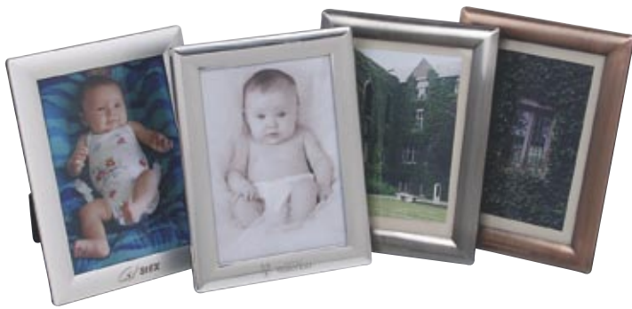
◀ F100 – Designer Metal Photo Frame 5" x 7" Available finishes include polished silver, antique silver and satin pearl. Includes laser engraving in one location. Specify portrait or landscape orientation for engraving. Minimum quantity: 25