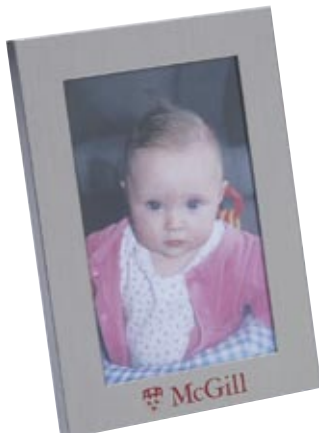
◀ PF15 – Traditional Photo Frame 5" x 7" PF14 – Traditional Photo Frame 4" x 6" PF13 – Traditional Photo Frame 3.5" x 5" Brushed metal finish adds contemporary style to this basic picture frame. Includes a one colour imprint. Minimum quantity: 75