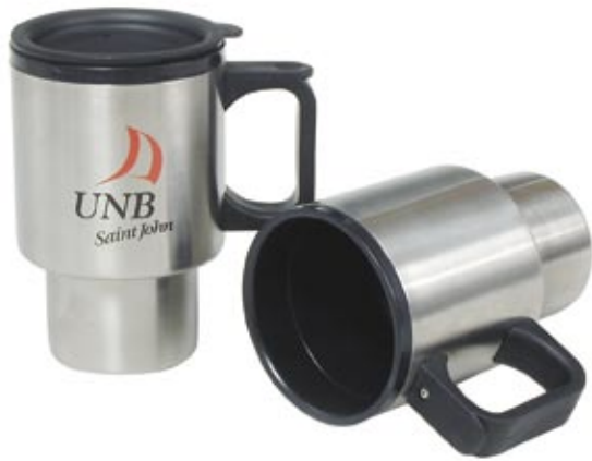
◀ S150 - Stainless Steel Tavel Mug with plastic liner A best seller! 14 oz. 18-8 stainless steel travel mug with plastic liner. Keeps liquid hot or cold. Includes a one colour imprint. Minimum quantity: 50